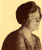
EDITH MASON who tone-tests Crosley Radio Receivers

Much of the beautiful tone of these Crosley NEW Leadership Models can be attributed to the suggestion and help of such noted artists as Alma Gluck, Edith Mason, Efram Zimbalist, Jose Mojica, George Gershwin, and others equally famous. With Crosley sets in their homes, these artists "listen in," comment, advise, and give Crosley engineers the invaluable benefit of their opinions. In this manner, the tone quality of Crosley radio is developed and constantly improved to a richness, color and naturalness that mechanical tests alone could never attain. And this beautiful tone is exclusive with Crosley.