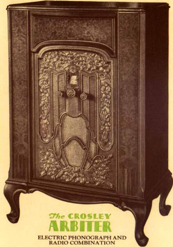
The CROSLEY ARBITER

Available with D. C. Chassis at same price.